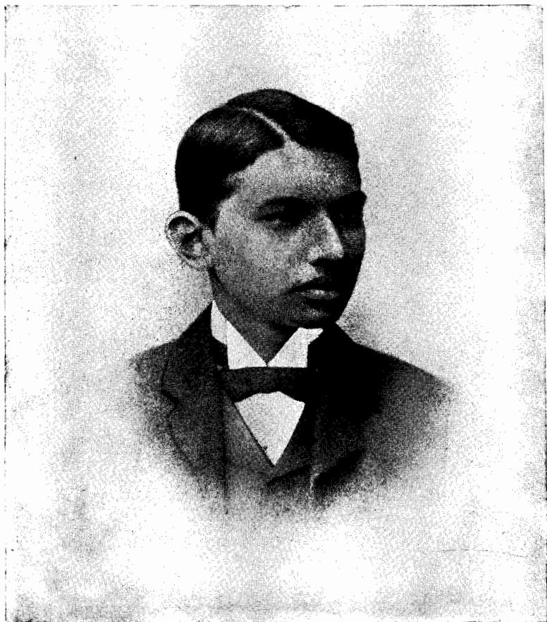
MAHATMA GANDHI (As a Law-Student in London 40 Years Ago)