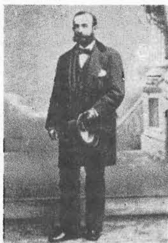
Daniel C. Gilman in the early seventies as president of the University of California.