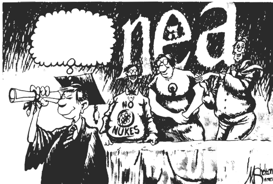
MIND BLANK—THE ORDER'S OBJECTIVE FOR EDUCATION