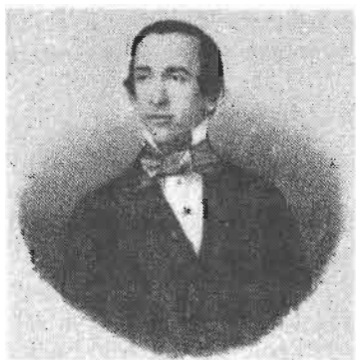
Daniel C. Gilman in 1852 as a senior in Yale College.