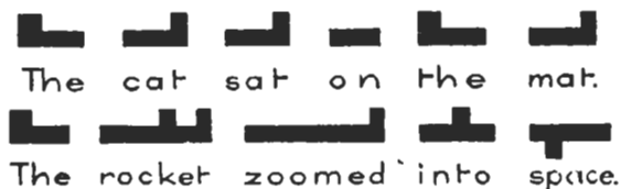
The visual patterns of words in two sentences

Why? That we shall see as the story progresses.